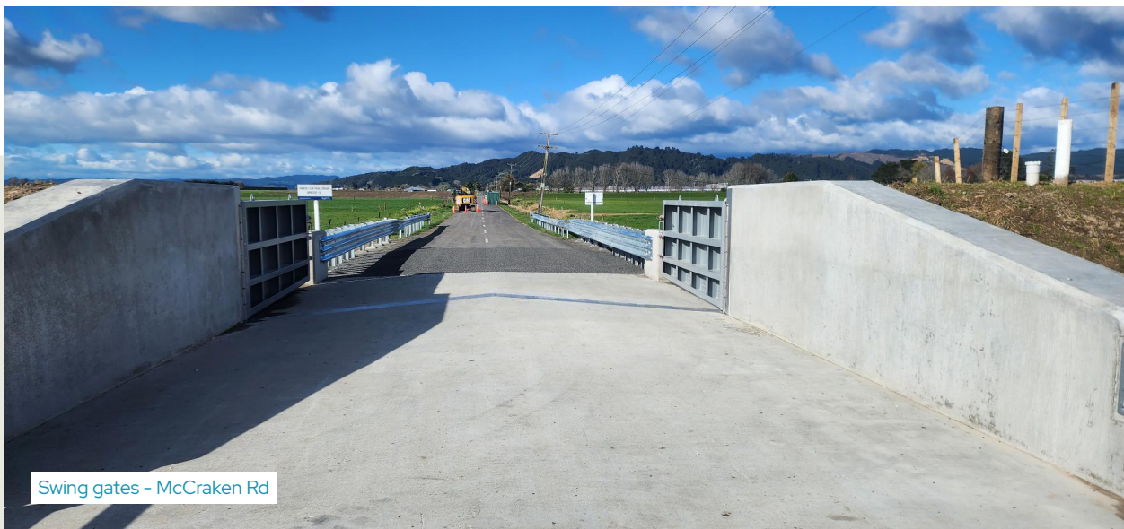
Swing gates - McCracken Rd

In a flood event, these swing gates will act as a barrier on the road, keeping cars from entering a flood zone, and maintain the stopbank height of the Floodway, creating a channel that will help send water out to the Rangitāiki River mouth.